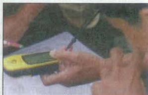
Michelle Hesppe/The Cambodia Daily

In the days when China's women were denied an education or an opinion, they devised their own means of self-expression. pg 6